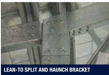
LEAN-TO SPLIT AND HAUNCH BRACKET