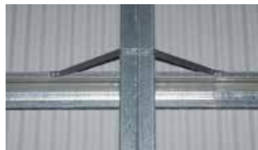
TOP HATS OR Z PURLINS WITH FLY BRACING