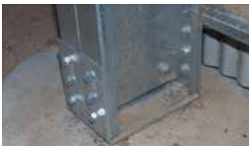
VARIOUS FIXING METHODS AVAILABLE