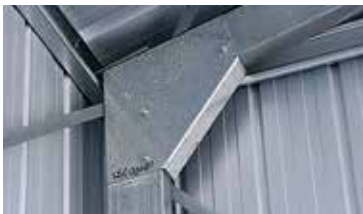
RAFTER-OVER-COLUMN HAUNCH BRACKET