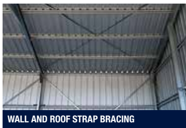
WALL AND ROOF STRAP BRACING