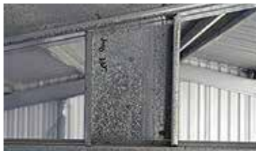
APEX BRACE AND DROPPER